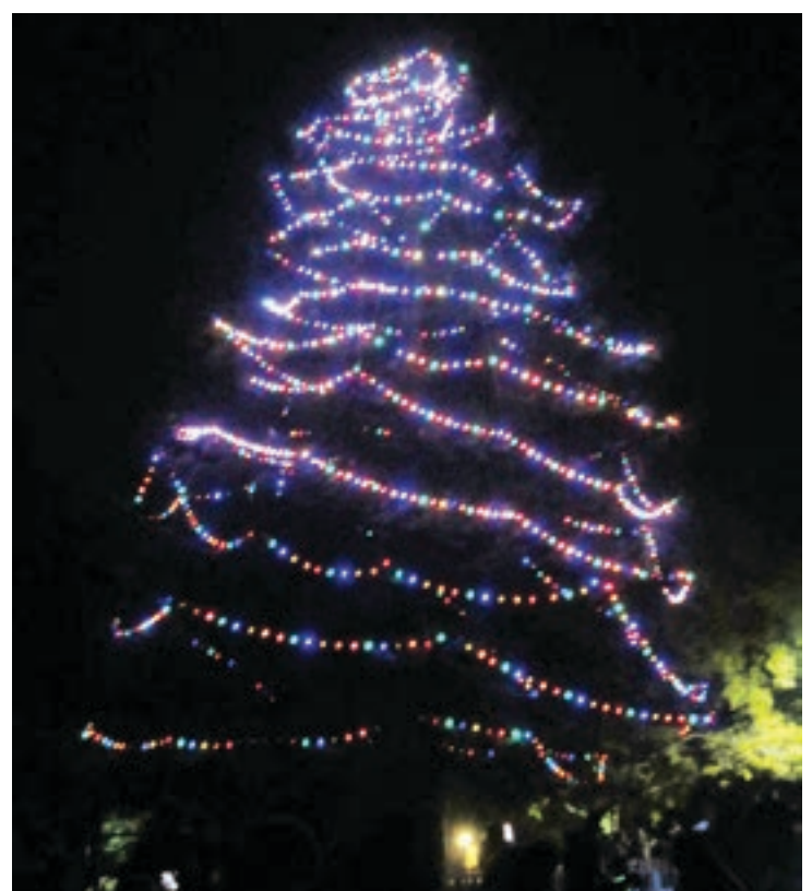
Holiday Tree lighting at last year's much drier event.